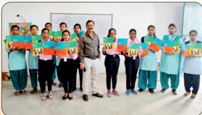
Mahindra Training for Girl Empowerment