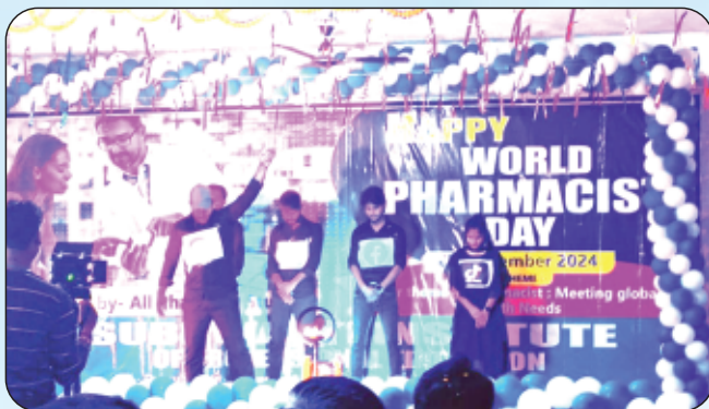
WORLD PHARMACY DAY