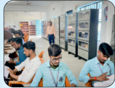
LIBRARY WITH E-RESOURCES