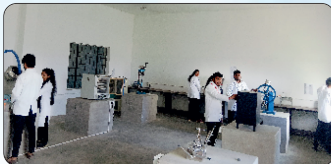
State of the art Lab : Specialized labs for hands on learning in various fields of engineering and technology