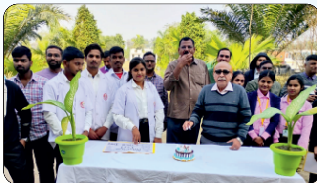
National Leftovers Day