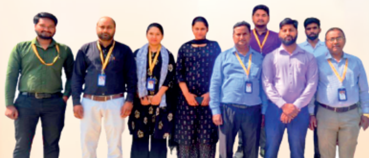
Academic Faculty Members