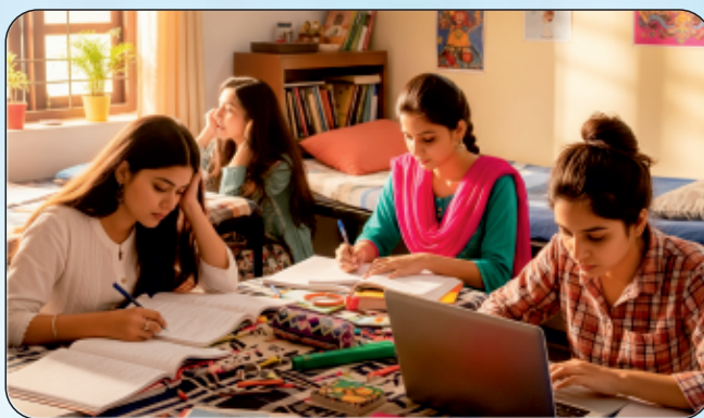
Hostel Facilities : Comfortable, safe, and well-furnished hostels for both male and female students.