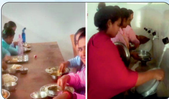
Cafeteria : Clean and hygienic dining options offering a variety of healthy meals.