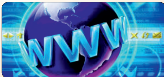
High-Speed Internet Connectivity : Fast and reliable internet access across the campus to support academic research and communication.