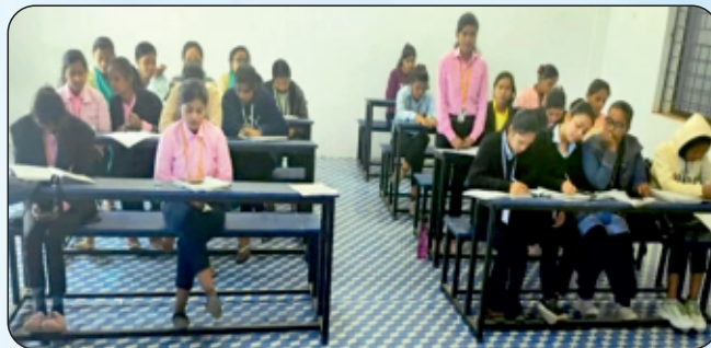
Modern Classrooms Well-equipped, spacious, classrooms.